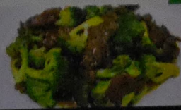
Beef w/ Broccoli