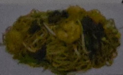
Assorted Lo Mein