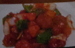
Sweet & Sour Shrimp