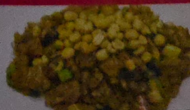
Kung Pao Chicken