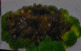
House Special Beef

We can alter the spices according to your taste. Ask for mild, medium, hot or very hot.