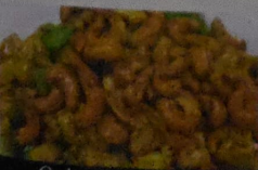
Cashew Nuts Chicken