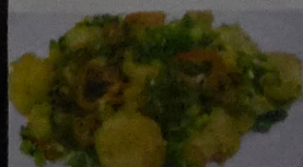
Salt & Pepper Shrimp

We can alter the spices according to your taste. Ask for mild, medium, hot or very hot!