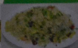
Yang Chow Fried Rice