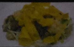
House Chow Mein