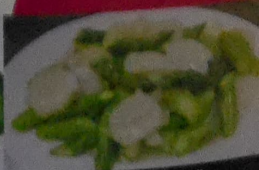
Asparagus with Scallops