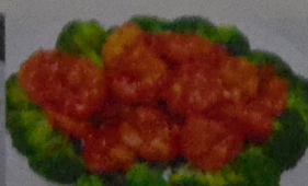
House Special Shrimp