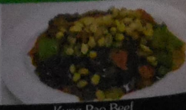
Kung Pao Beef