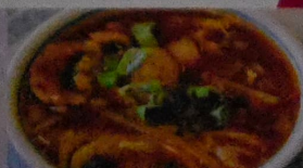
Hot & Sour Soup